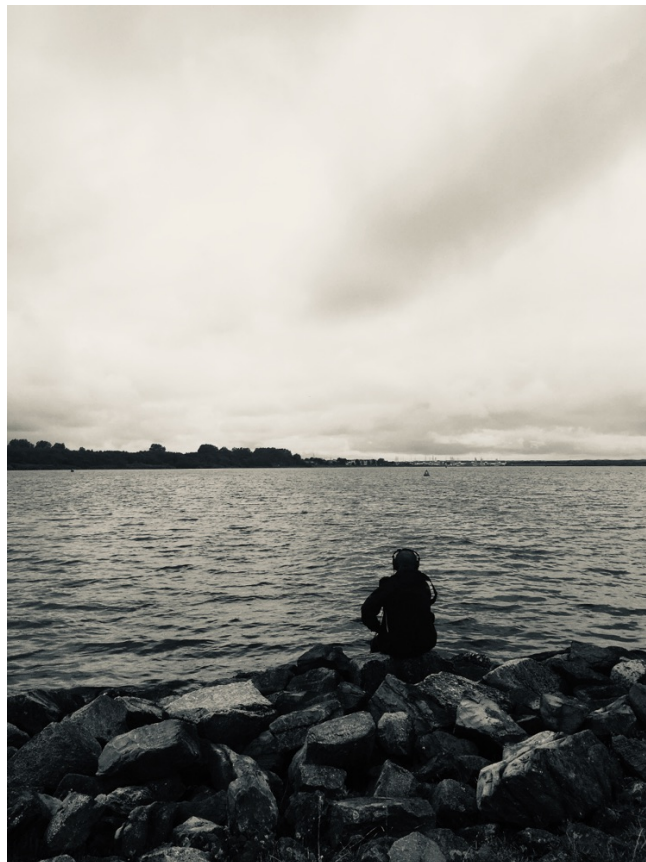
hydrophone recordings at Grevelingen (NL).